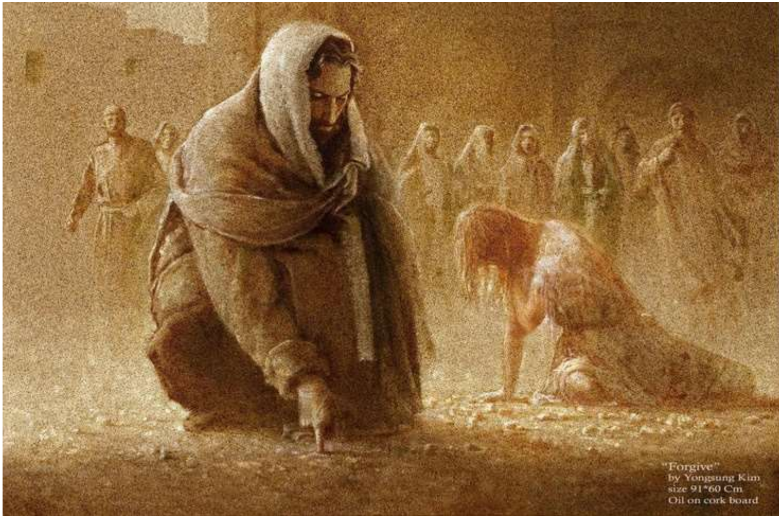
"Forgive" by Yongsung Kim size 91*60 Cm Oil on cork board